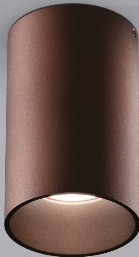
OKKIO 55 CL